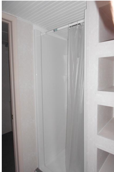
Single Shower Room