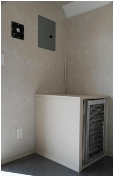
Dirty Room / Negative Pressure